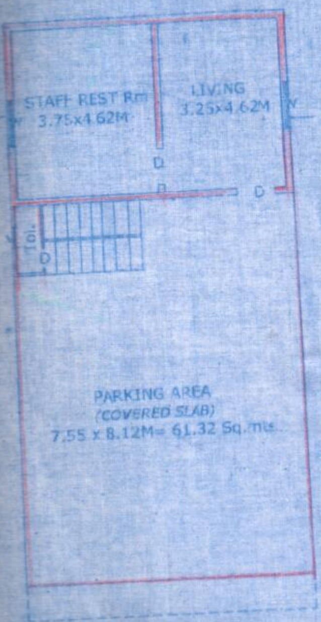
PROP. G.F. PLAN