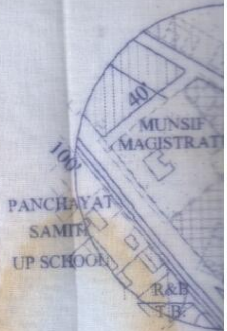
MASTER PLAN SITE UNDER SCALE : 1:200