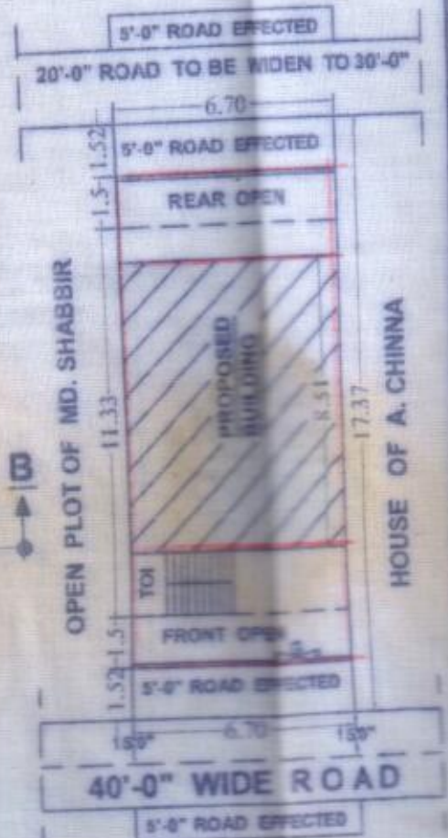
SITE PLAN SCALE : 1:200 C.N.