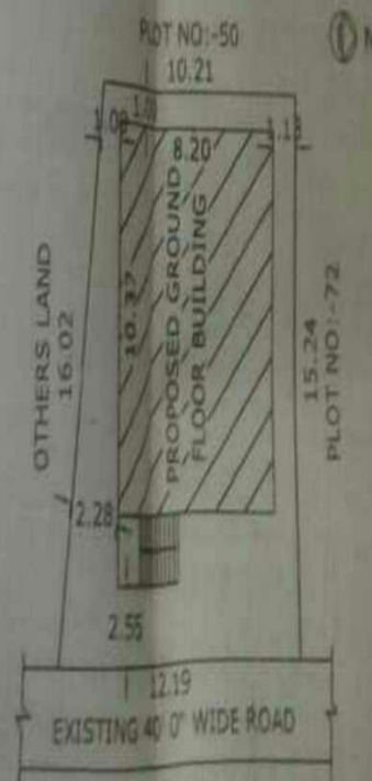
SITE PLAN SCALE:-1:200

AYYAGARIPETA LOCATION OPENING D. DOORS 1.00M W. WINDOWS 1.2 V. VENTILATOR 0.8 TOILETS - 4 Nos STAIR CASE - 1 AREA TOTAL SITE - 1 PLINTH AREA C GROUND FLOOR OPEN SITE - INDE PROPOSED - EXISTING - ROAD OPENING - APPLICANT P. SUSEELA K. MAHESHWARI K. MAHESHWARI