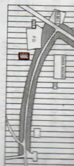
EXTRACT OF MASTER PLAN.