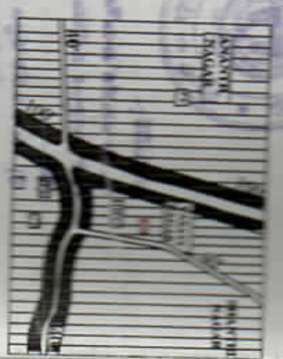
EXTRACT OF G.P. NO. 2/97 OF KARNANAGAR SCALE 1"=400'-0" SEE UNDER REF.

PARAPET WALL R.C.C. SLAB BRICK MASONRY FLOORING R.C.C. SLAB FLOORING BRICK MASONRY FLOORING PLINTH BEAMS