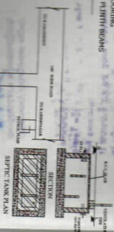
SECTION SEPTIC TANK PLAN