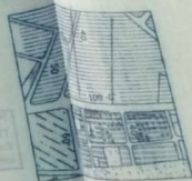
Extra-Master Plan Under Reference